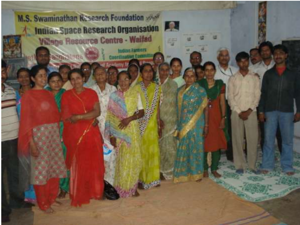
Women farmers on exposure trip to village resource centre

on organization management. About 2200 ha. of land have been brought under one or the other sustainable agriculture practice for which the women farmers have received training. Adoption of best practices in members' field has created demonstration effects in MKSP villages resulting in demand by non-members for capacity building on these issues. So while the programme directly covers only its members, the impact of the interventions under the programme extends to a larger section of the society resulting in a multiplier effect.