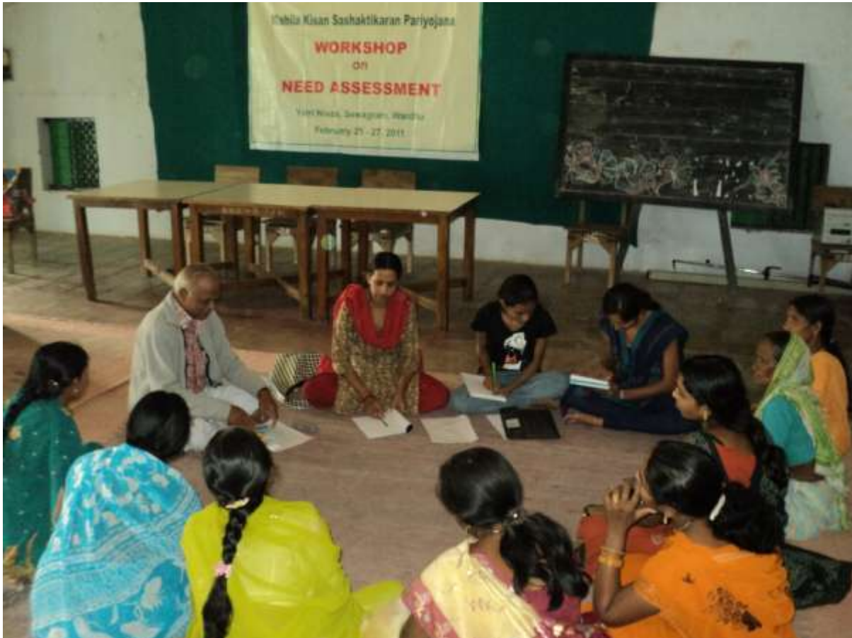
Participatory need assessment with women farmers