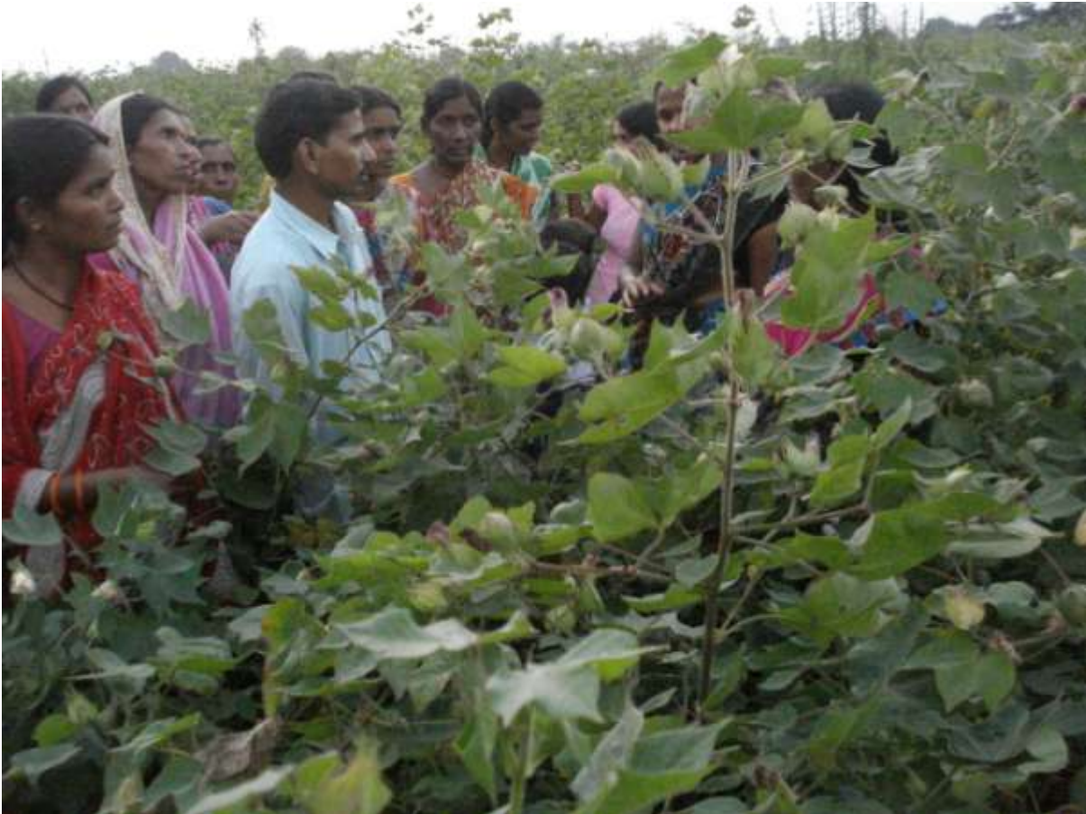
Training on insecticide resistance management