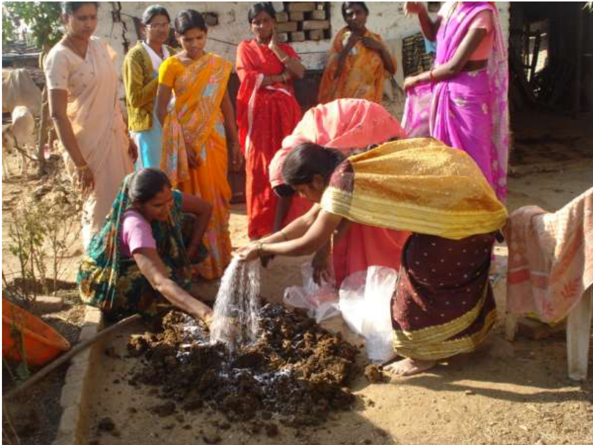
Preparing integrated fertiliser