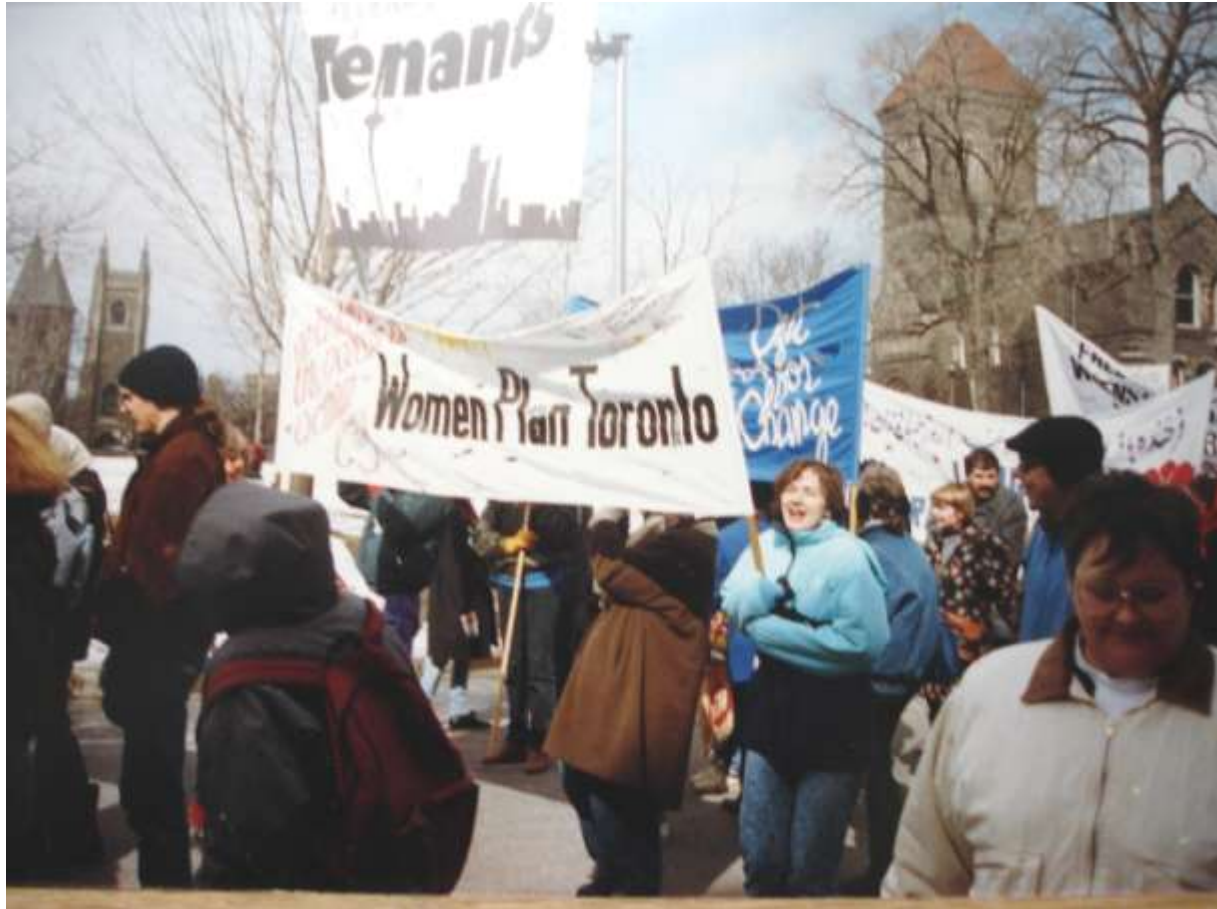
Carrying the WPT banner at an International Women's Day rally

In addition, there were countless deputations, interventions, speeches at conferences, articles in newspapers and magazines, media interviews, participation in rallies and further workshops with women's groups, lawyers, professional planners and planning students to increase awareness of women's issues.