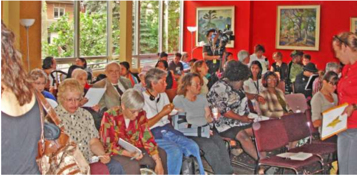
TWCA launching its research report: "Communities in which Women Count"