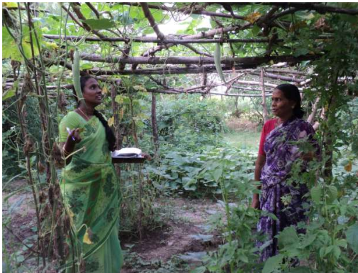
Extension staff visiting a kitchen garden

also provided for the construction of common biopesticide production units in villages. Topics like land preparation, seed treatment, nursery preparation, nutrient management, pest and disease management, biopesticide preparation and harvest formed part of the training modules. Trainings on specific preparations using herbs for taking care of common ailments were also given by involving Ayurvedic doctors. Techniques of cultivation of common herbs were taught by botanists in the team.