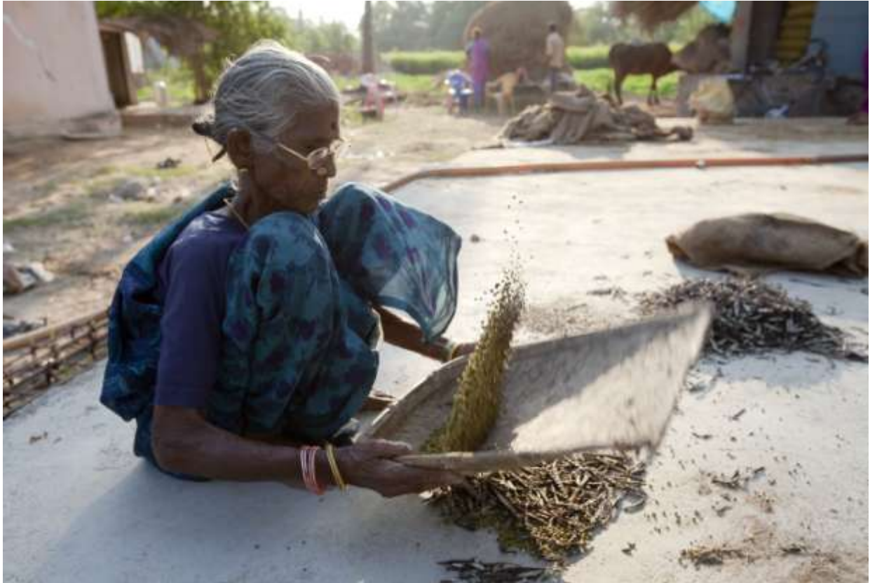
Woman farmer processing vegetable seeds before storage