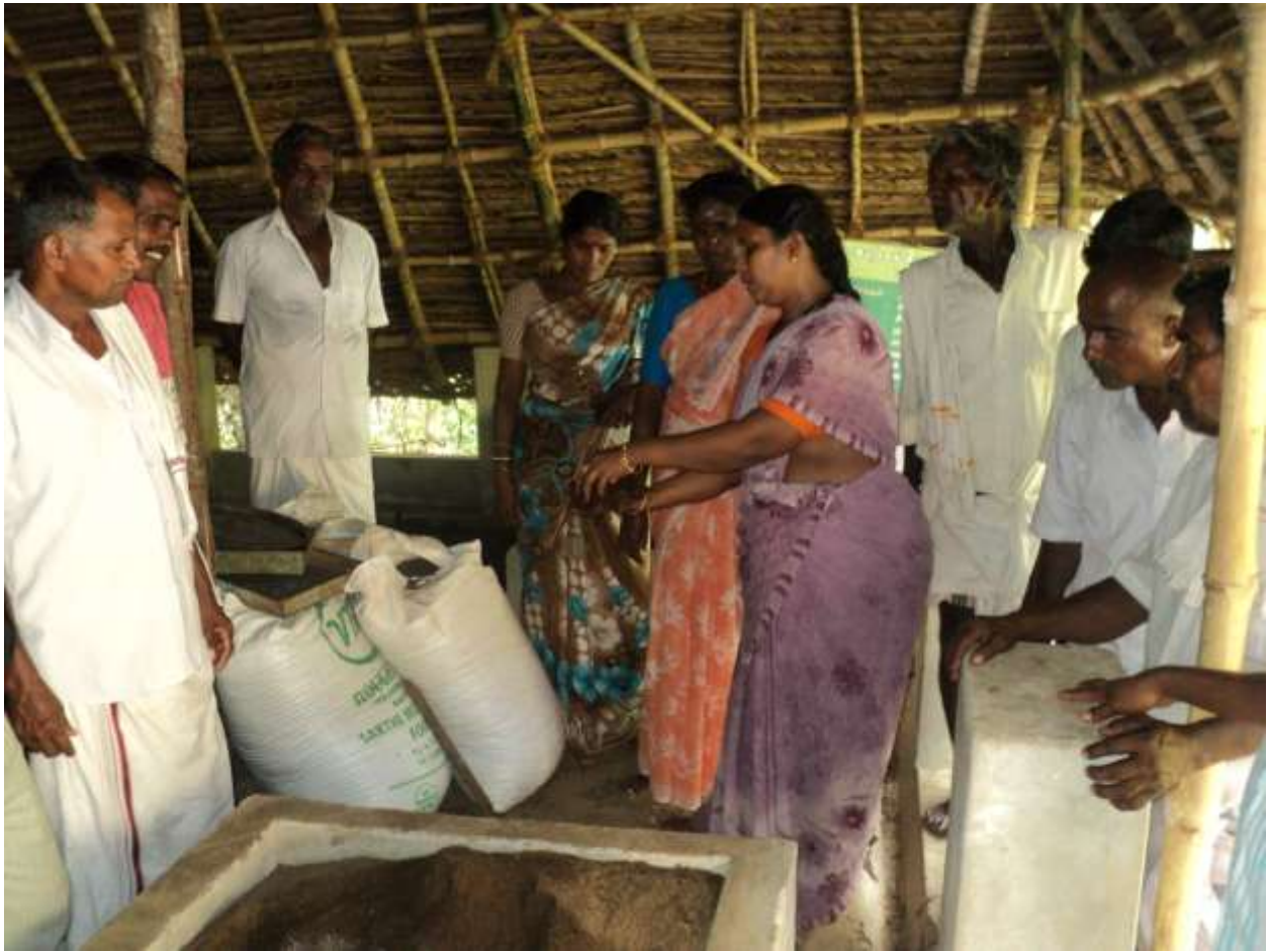
Community vermicompost unit maintained by women beneficiaries

There are also men who have taken up kitchen gardening in their homes. According to them it is a joint effort of both men and women. They have realised the importance of consuming vegetables as it also keeps illness and other diseases at bay. They give the entire credit for this to the women of the village, CIKS and more particularly to the women of their household