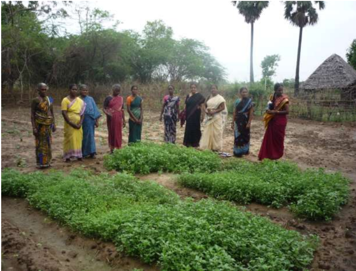
Leafy green plot in the community kitchen garden in Aadthamangalam district

hopeful of increasing production by fine tuning the lessons they have learnt in their initial attempt.